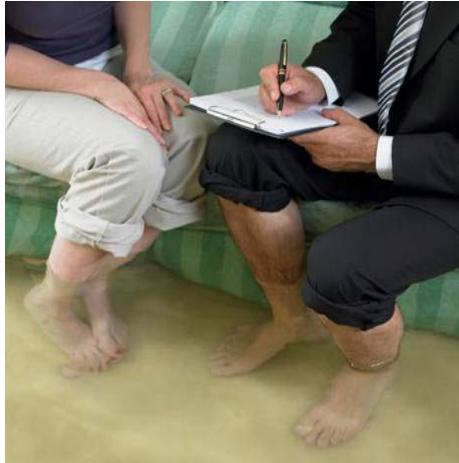
Flooded basements from water and sewer backup can cost over $100,000 to fix.

Homeowners with the Atlantic Master Plan do not have this coverage problem. The Atlantic Master Plan automatically includes coverage for